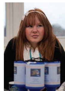
Students take part in Red Nose Day