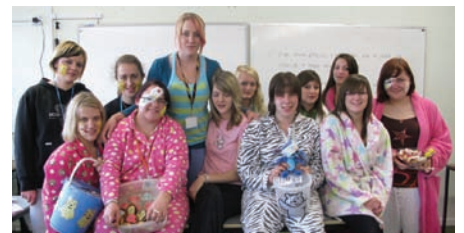
Photo shows Childcare students raising money for Children in need.