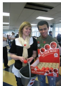
Raising money for the Nightshelter