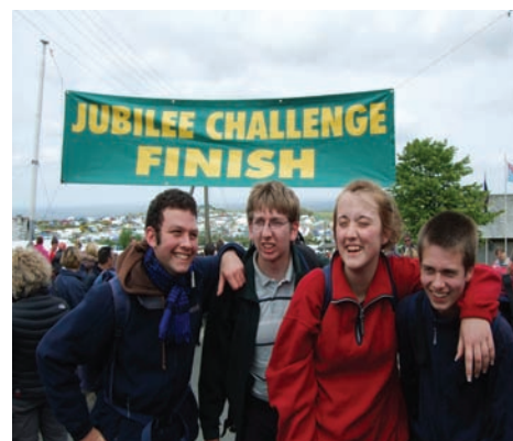
Foundation Learning students complete the Ten Tors Challenge!

A team of four Yeovil College students have successfully completed a project to design a way of giving disabled access to Lynx Helicopters during Naval Open Days