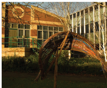
University Centre Yeovil students find their voice...