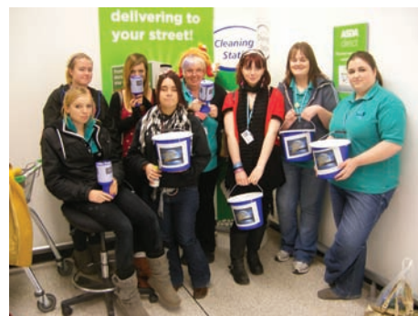
Students raise £300 for charity, packing bags at ASDA supermarket

Contact ( angela.coward@yeovil.ac.uk or ruth.morgan@yeovil.ac.uk)